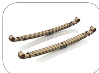
India's 1 st LCV with Front Parabolic suspension for superior ride comfort