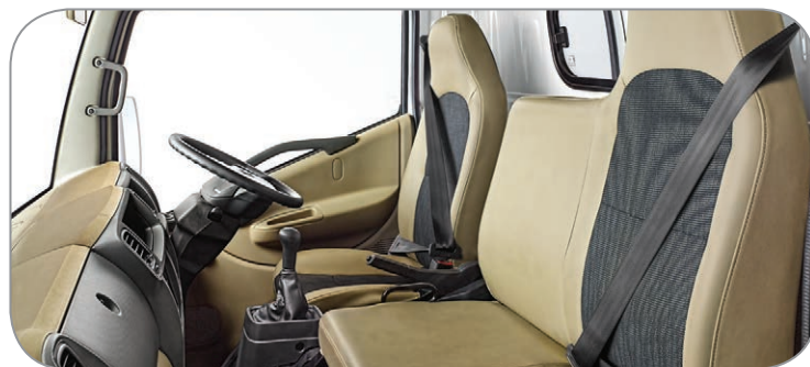
Euro Cabin with Modern and Comfortable Interiors